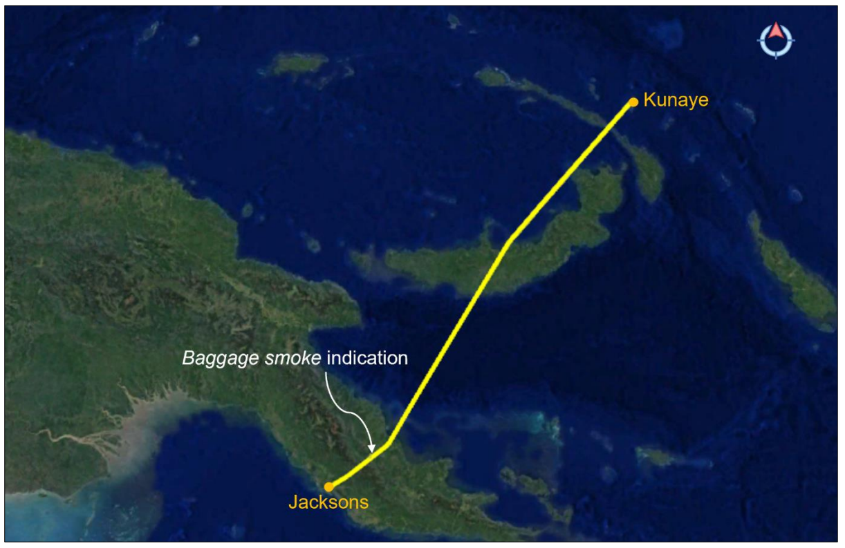
Figure 1: P2-MEH depiction of flight path from Kunaye to Jacksons Airport.

At 11:00, the crew declared<sup>2</sup> a PAN and subsequently approached and landed at Jacksons International Airport.