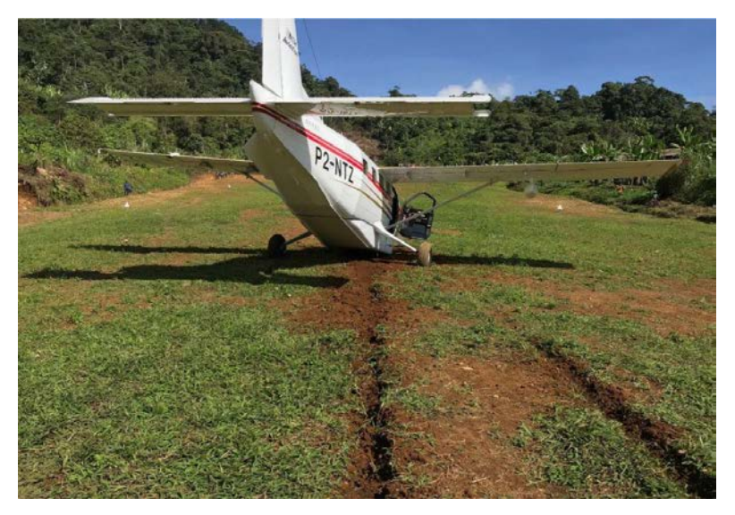
Figure 2: P2-NTZ at Mibu Airstrip showing wheel tracks in strip soft surface

The pilots reported that earlier that day they had received a strip report and learned that the Mibu Airstrip was dry and suitable for a landing. On arrival over the Mibu Airstrip the PIC flew the aircraft down the strip in the take-off direction to conduct an aerial inspection of the strip surface. The pilots subsequently reported that they did not observe any standing water, mud or cracks on the strip surface. They then conducted two circuits terminating in go-arounds for approach profile planning.