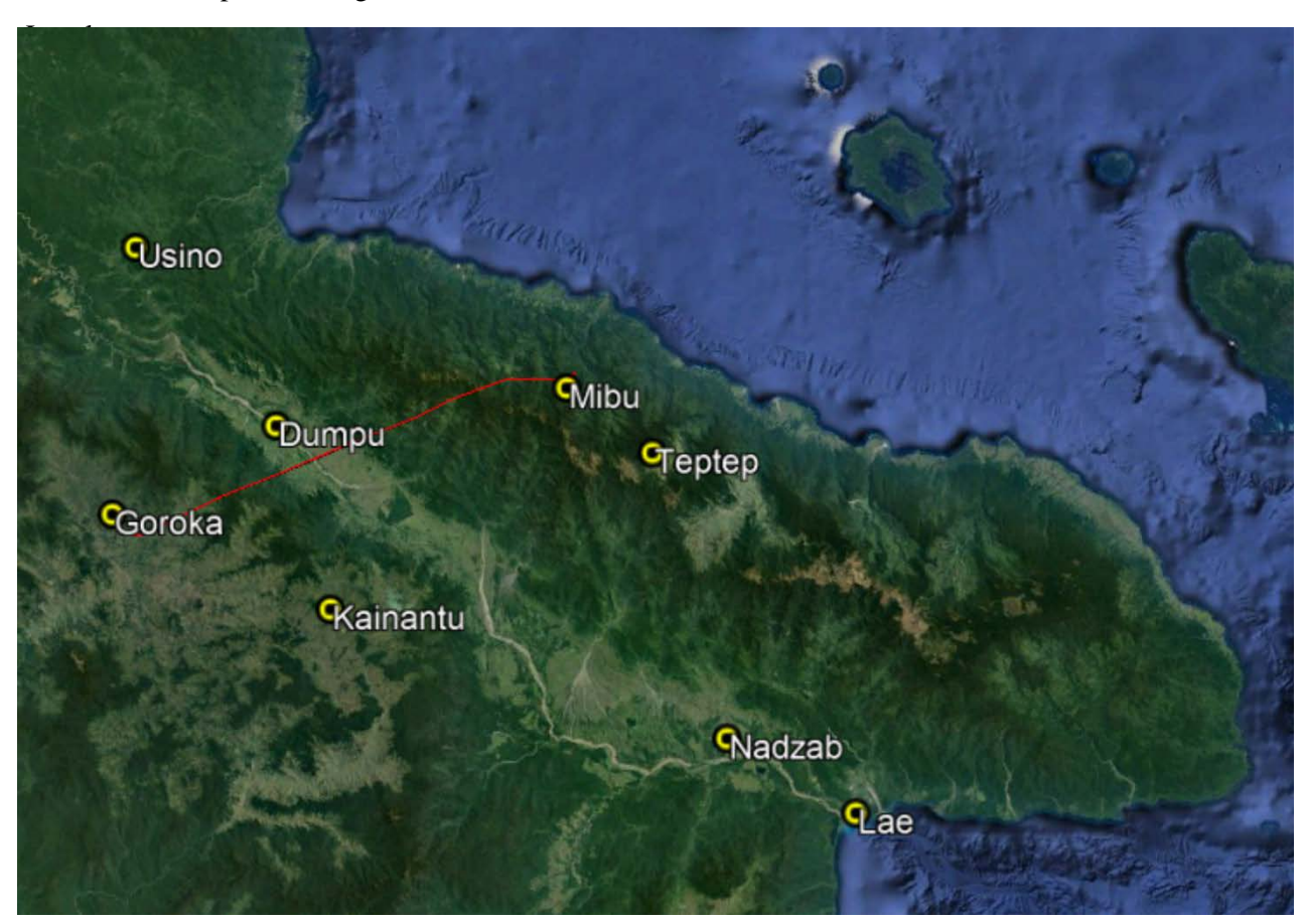
Figure 1: Showing the track flown Goroka to Mibu

On 9 August 2018 local (8 August 2018 UTC), a Quest Kodiak 100 aircraft, registered P2-NTZ, owned and operated by New Tribes Mission (NTM), was flown from Goroka, Eastern Highlands Province, to the newly built Mibu airstrip in Madang Province.