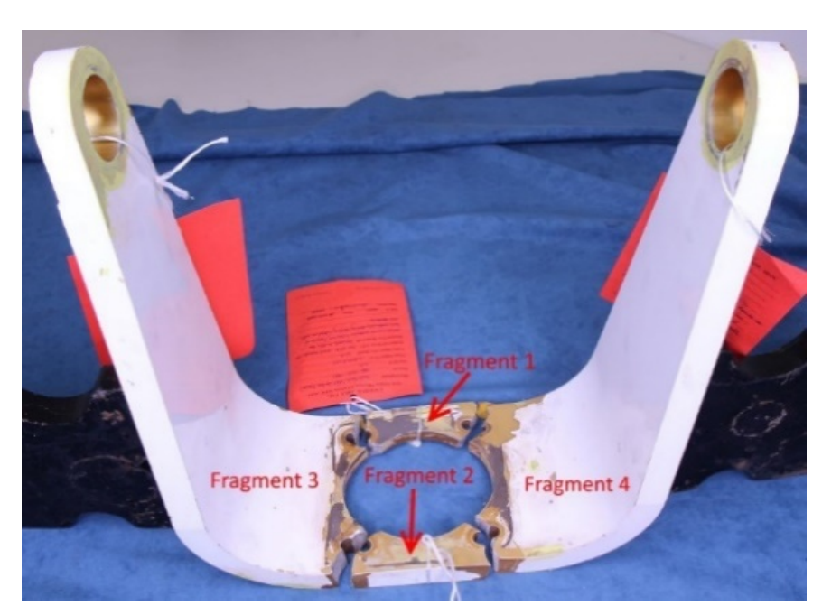
Figure 8: Fragment pieces of the NTZ nose-wheel fork

The investigation reviewed the NTM maintenance documentation that showed that an NDT inspection had been carried out on 20 June 2018 for the initial inspection in accordance with FSI-147. During the accident the nose landing gear fork fractured as described by the aircraft manufacturer in FSI-147.