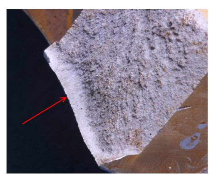
Figure 9: Microscopic view of fracture surface arrow points to shear lip

There is no evidence of pre-existing damage observed on the fork, and all of the fractures appeared to be a result of overstress.