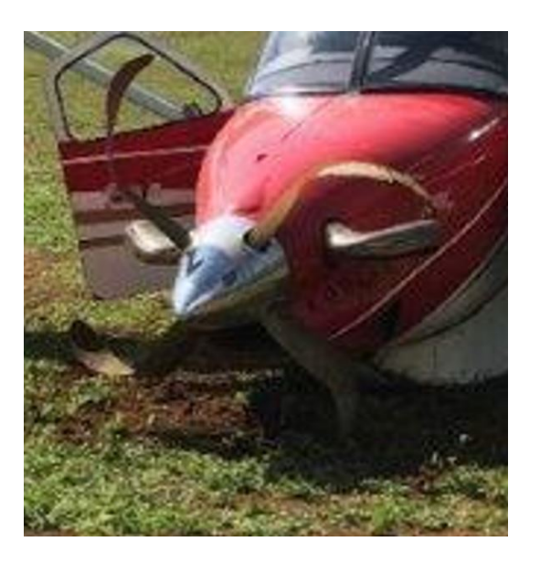
Figure 4: Nose wheel and fork assembly in bog hole Figure 5: Propeller assembly

During July 2018, NTM personnel accompanied by a Geologist from the Rural Airstrip Agency (RAA) had flown to Mibu Airstrip by helicopter and conducted a detailed inspection of the strip. The Geologist's report included that drainage needed to be constructed on both sides of the strip. Continuous [water runoff] flow has the potential to cause erosion inwards onto the strip. Sub-surface strength needs further work to strengthen it. The report provided brief examples of how that could be achieved. The report also stated that the surface can be intermixed with sand or gravel to provide some traction, cohesion, strength and durability.