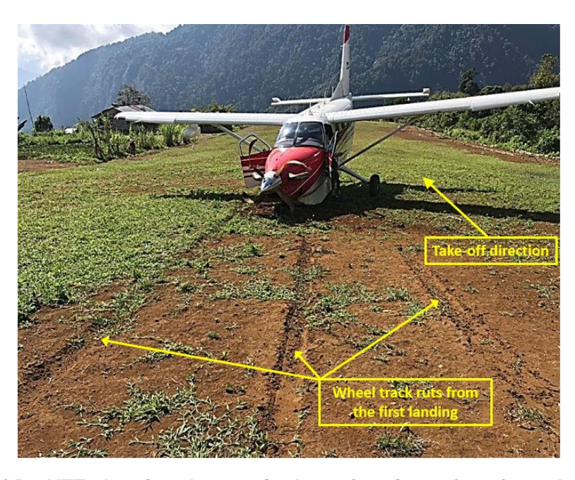
Figure 3: View of P2-NTZ showing the ruts in the soft strip surface from the first landing

During the next landing roll the aircraft's nose wheel sank into the soft surface of the strip and became bogged. Subsequent substantial damage included the nose-landing gear, propeller, engine and cowling.