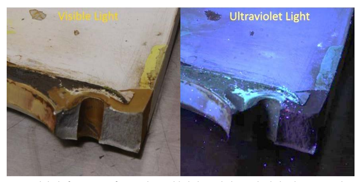
Figure 11: Bolt hole fracture surface under visible light and ultraviolet light showing evidence of fluorescent penetrant