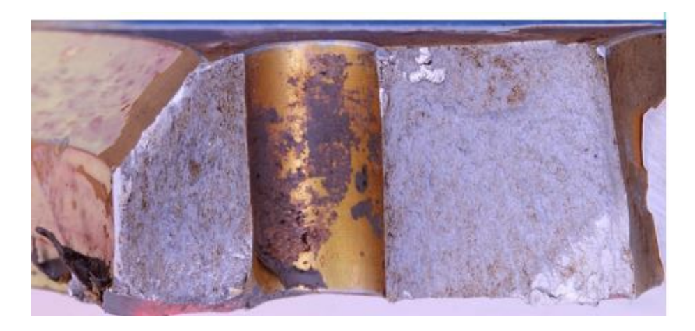
Figure 10: Microscopic view of fracture surfaces